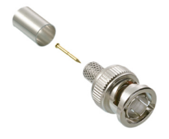
307-2TP BNC Male 3PC Crimp-Crimp, 75 Ohm