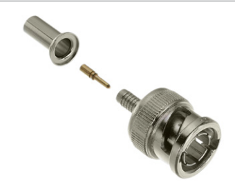
307-18TP BNC Male 3PC Crimp-Crimp, 75 Ohm