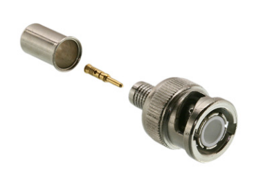
305-1TP BNC Male 3PC Crimp-Crimp, 50 Ohm